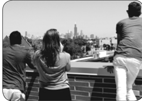
2015-2016 Volunteers enjoying the view from Lawndale Christian Health Center's rooftop after a long day of Training and Orientation.

Volunteers have been serving for over 10 years!