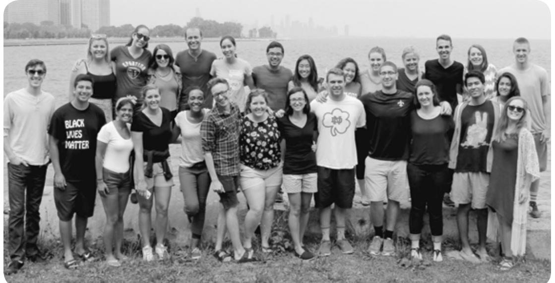
2015-2016 Amate House Volunteers

Welcoming our new 27 Volunteers to Chicago