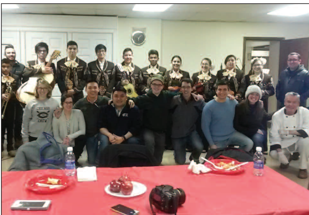
University of Illinois at Chicago students gather during an immersion retreat at Our Lady of Guadalupe Parish in Des Plaines, Illinois.

8 Polish radio/television stations and newspapers communicated about immigration issues aided by PIIMs