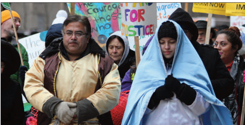
Network representatives lead the 10th annual Posada for immigration reform in downtown Chicago.

500 homeless Polish immigrants were provided a Christmas dinner