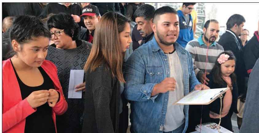
DREAMers receive resource information at St. Gall Church .

150 people walked in the 10th annual Posada for immigration reform