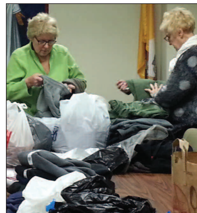
Volunteers sort coats collected for detainees at Broadview Detention Center.