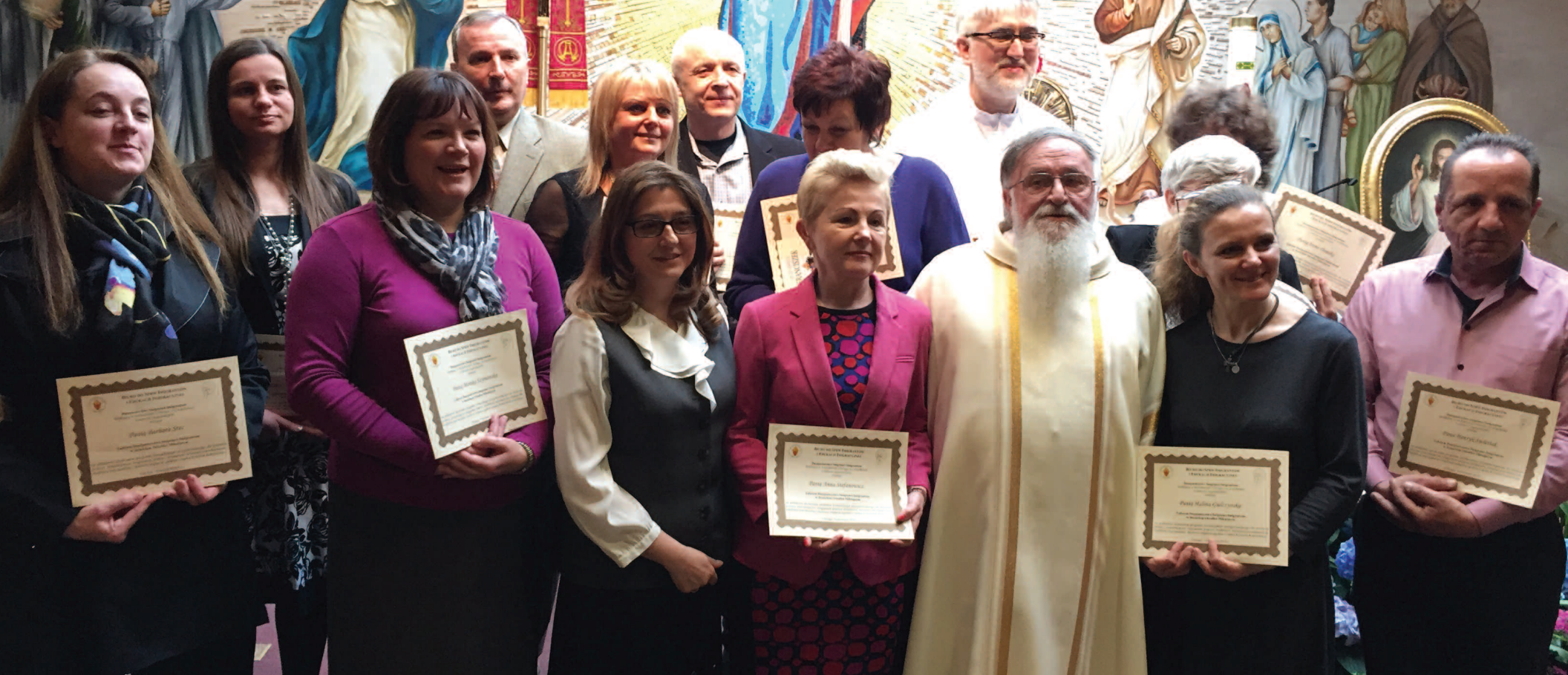
Polish Immigrant-to-Immigrant Ministry leaders from Sacred Heart Mission hold their certificates after their commissioning service.