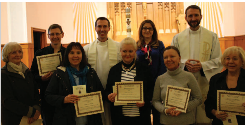
Polish Immigrant-to-Immigrant Ministry leaders from St. Ferdinand Parish hold their certificates after their commissioning service.

100 lay leaders, representing 26 parishes, participated in the 7th annual Pastoral Migratoria retreat