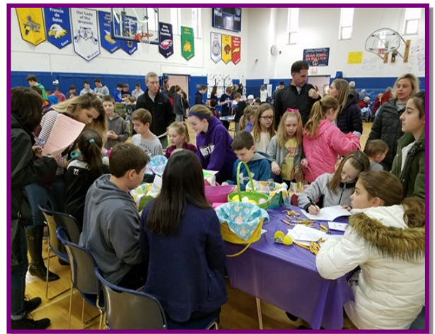
Our Lady of the Wayside's Parish Service Day project to benefit children living in WINGS shelters

Our Lady of the Wayside, Arlington Heights, held its annual Parish Service Day in March. The Domestic Abuse Ministry presented its work: It had collected donations of supplies, gifts and money, and volunteers assembled 50 Easter baskets for children living in WINGS domestic violence shelters. The baskets included a lovely card, a book and bookmark, several toys and special Easter candy. The baskets were beautifully finished in brightly-colored cellophane wrap tied with a huge bow. The parishioners were pleased to create these nice Easter surprises donated to children who have experienced abuse in their families, and WINGS staff and families greatly appreciate these Easter blessings.