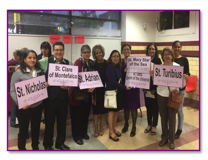
Volunteers from parishes with domestic violence ministries in the Chicago area hold up signs naming the 110 parishes that have had weekend preaching on domestic violence. Approximately 1,000 people attended the annual Mass to End Domestic Violence at Holy Name Cathedral on September 30th.