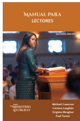
Guide for Lectors , Second Edition, English and Spanish, Liturgy Training Publications, Chicago