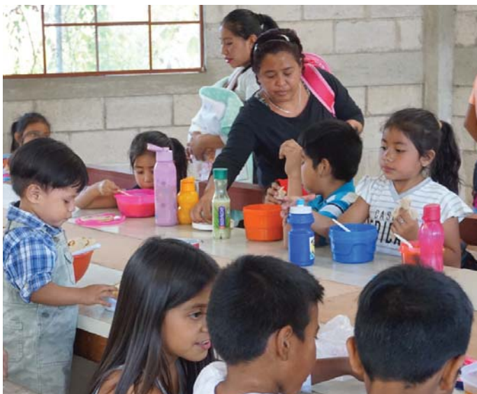
Lunch is served at the nutrition project in Guatemala.

One example is the Missionaries' nutrition project in the La Labor region of Guatemala.