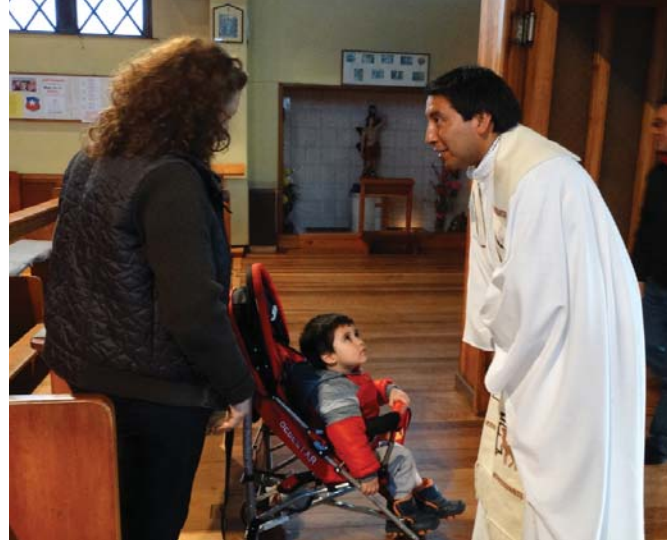
A Missionary visits with parishioners after Mass in rural Chile.

We're working with lay volunteers who cook lunch several times a week in a simple kitchen behind Our Lady of Carmel Chapel. They serve a hot, nutritious lunch to the dozens of young children who come from miles around. Malnutrition is a real problem in Guatemala; volunteers track the children's weight to be sure the project is helping—and it is!