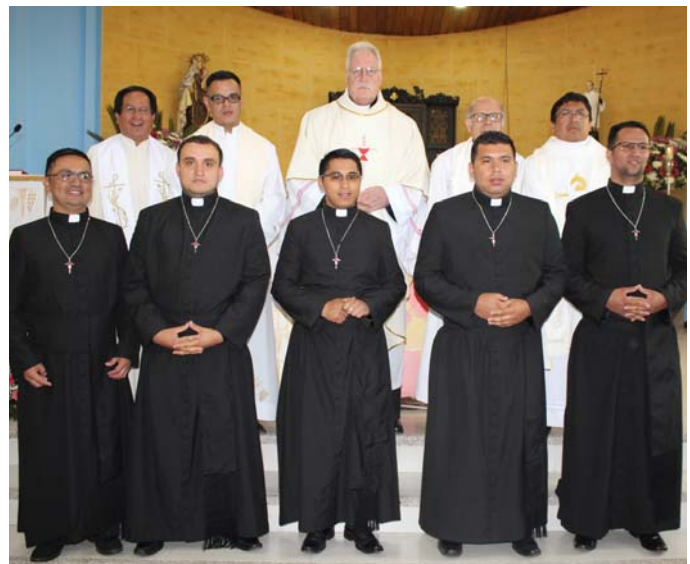
Seminarians gather at a mass in Colombia.

We're working with lay volunteers who cook lunch several times a week in a simple kitchen behind Our Lady of Carmel Chapel. They serve a hot, nutritious lunch to the dozens of young children who come from miles around. Malnutrition is a real problem in Guatemala; volunteers track the children's weight to be sure the project is helping—and it is!